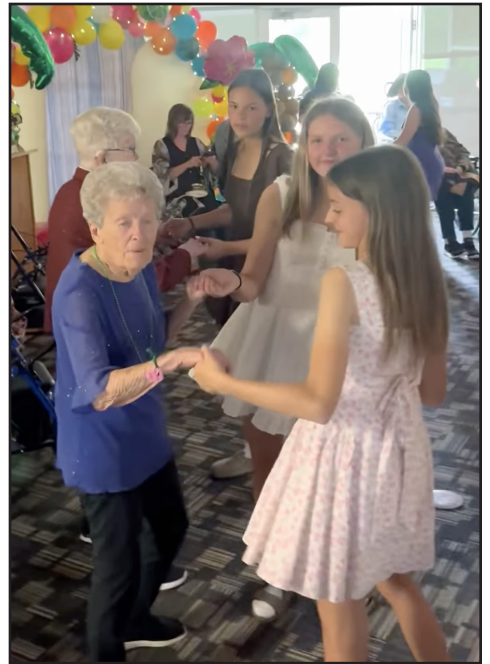
The Burlington Middle School civics class recently attained a grant to host a “senior prom” at The Meadows. Approximately 40 residents from The Meadows and LifeCare Center of Burlington had a wonderful time listening to live music and dancing with a great group of students, sponsors, and staff. Thank you to everyone who made it a special evening for the residents—and staff!